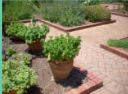
Herb Garden (Athens, GA) in May '08