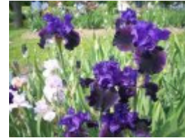
Presby Memorial Iris Garden in bloom last May

Flower Shows Held, Teaneck and Radburn Garden Clubs Hold Exhibitions for Clubs in the Sixteenth Annual Flower Show of the Federation of Garden Clubs of Bergen County, Held Today in the Hackensack Women's Club. More than 2,000 persons attended the show, which established a record for size.Thirty-three clubs participated. There were 750 entries. New York Times , September 19, 1951---Compiled from New York Times Archives .