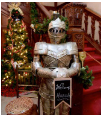
Knight in armor guarding the Manor staircase

The New Jersey Botanical Gardens/Skyland Holiday Open House is an annual event that many look forward to attending each year. Well, that time will soon be here. The dates are Thursday, December 1st to Sunday, December 4th, each day: 10 AM-4 PM. There are also two evening receptions, Friday, December 2nd and Saturday, December 3rd. Reservations for the evening events are recommended.