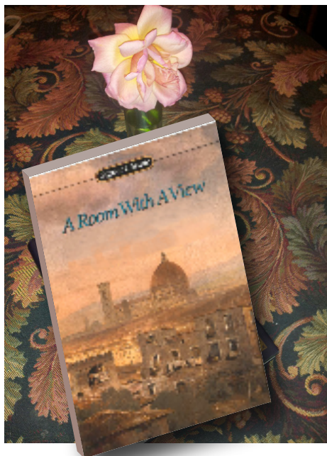
Garden Club of Teaneck theme: "A Room with a View"

For more information, visit the NJBG website at NJBG.org or see Dania Cheddie.