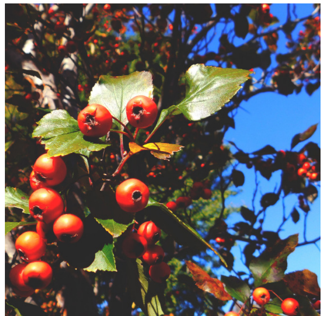
The Hawthorn tree outside of the front door of the Greenhouse, festooned with red berries.---Editor