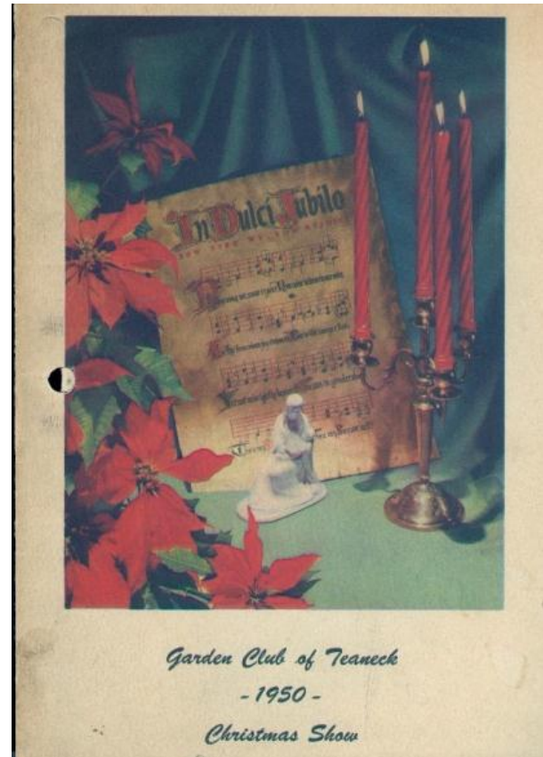
1950 Garden Club of Teaneck Flower Show

The Rutgers 37th Annual Home Gardeners School is March 23, 2013. The Home Gardeners School offers you expert instruction in the most innovative gardening and landscaping subjects available. For more information and to make reservations please see website www.cpe.rutgers.edu or telephone 732-932-9271. Robyn